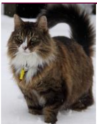
Lilly gets tummy deep in the snow

As temperatures plummeted and we were treated to snow, the likes we haven't seen for 20 years or so the cattery became snowed in for a week.