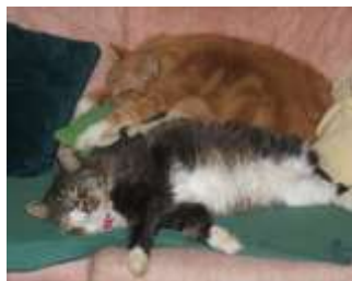
"Jack" with his new friend "Willy"

Piggly wiggly was a tabby and white kitten homed in 2001 in Southwick, we received a call from an RSPCA inspector about this cat who was being neglected by its owner. Of course we always take in our old re homes so I went to collect him, I was horrified to find that he was still entire and that his right eye was badly damaged plus he desperately needed a dental. I still don't understand how we missed that he had not been neutered 8 years ago. So off to Top Cat for castration, removal of useless eye and dental, all successful, he now lives in our house and is a most friendly addition to the clan. He has made friends with all the others especially Willie.