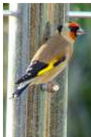
A Goldfinch, yesterday

We have also, at last, attracted arguably Britain's most colourful garden bird, the Goldfinch. Having put some niger seed in a separate feeder it took only 4 weeks for the never seen here before birds to begin using us as a fly-through. A truly wonderful sight along with the Sparrows, Dunnocks, Blue Tits and other birds that frequent our feeders. The cats are too well fed to bother them.