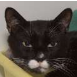
"Not since rescuing the 15 cats in St. Johns Road have I witnessed such a terrified animal."

Sometimes we have to get our rescue caps on and go in to households and take cats away from people that are being cruel. This October saw us rescuing a cat that had been beaten consistently with a broom and other implements which had got worse as the owner had become