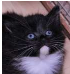
As cute as...

by some more, equally hungry squirming bundles of fluff. The Kitten shed is usually full on through the summer and things settle down as winter approaches but, presumably down to the longevity of warmer weather these days those unneutered Toms we talk about have been busy livening up those Indian summer evenings producing yet more mouths to feed and homes to find.