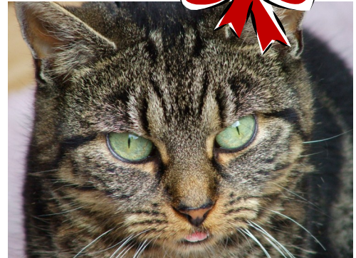
Wibbly Wobbly lives up to her name and is a favourite with the staff and visitors. She loves tickles—and food

We had a cat from a man who sold his house, he didn't tell the purchasers that his mothers old cat was living in an outhouse. The family in Lewes used to kick the pregnant females round the garden and the little male cats' nose and ears bled from sunburn. Vinny, whose owner gave him up as her neighbour shot at him. Tore and Owen who came in weighing 8and 9 kilos respectively, the kittens from Southwick so anaemic from fleas that they were lucky to survive. Wibbly Wobbly with brain damage but lovely. Scoomer the stray, whose blood pressure was off the scale. Crazy Colin with attitude, campylerbacter and boys bits. They all came here, were loved by the